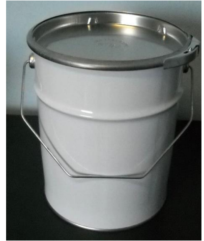
FOR ILLUSTRATIVE PURPOSES